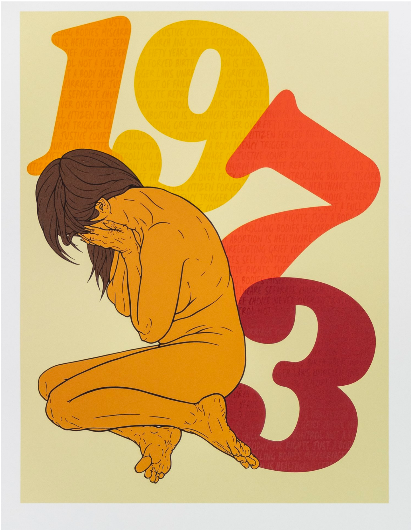
Revoked, 2022. Screenprint. 28 x 22 inches. Edition of 15.