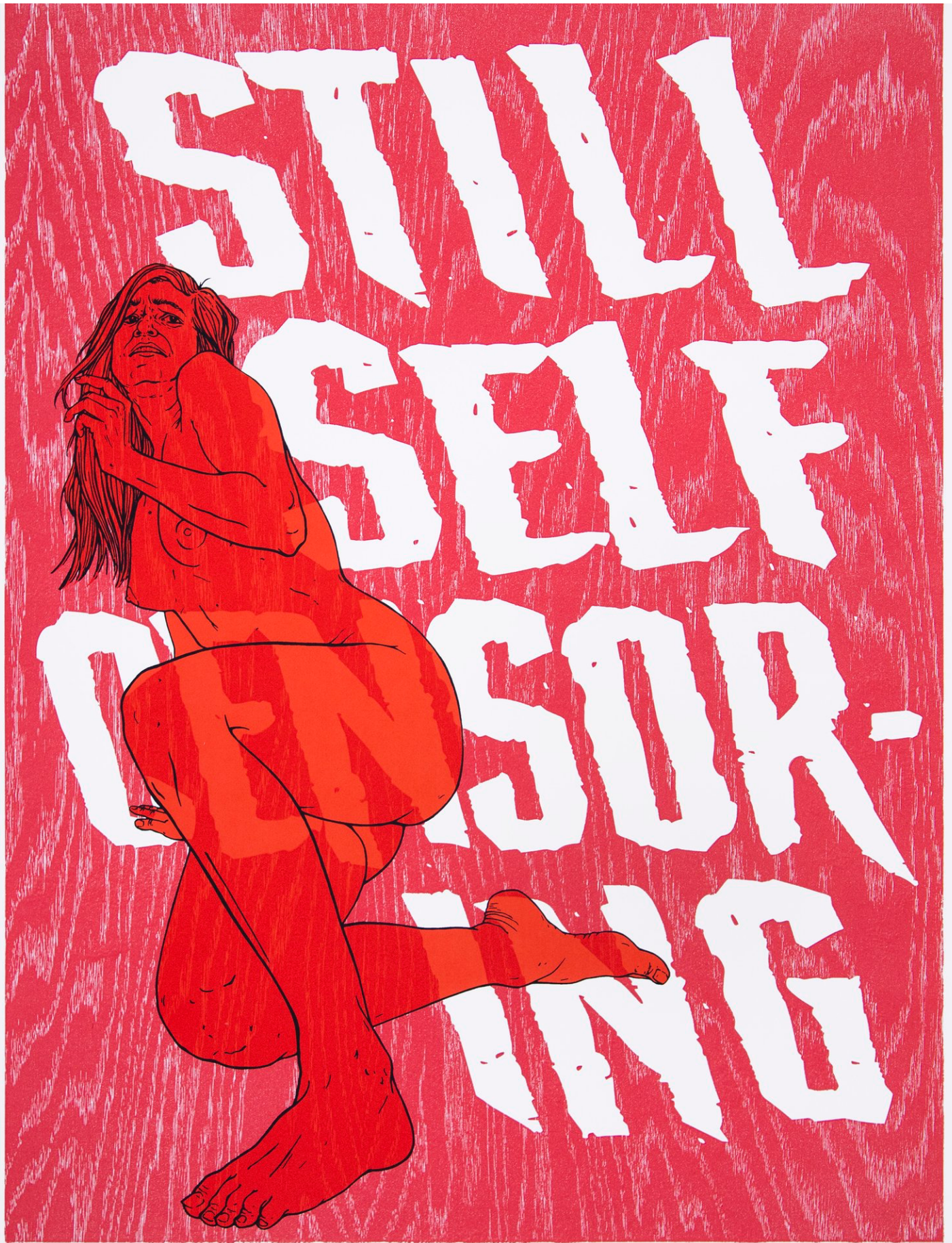
Still Self Censoring , 2021. Woodcut & screenprint. 28 x 22. Edition of 15.