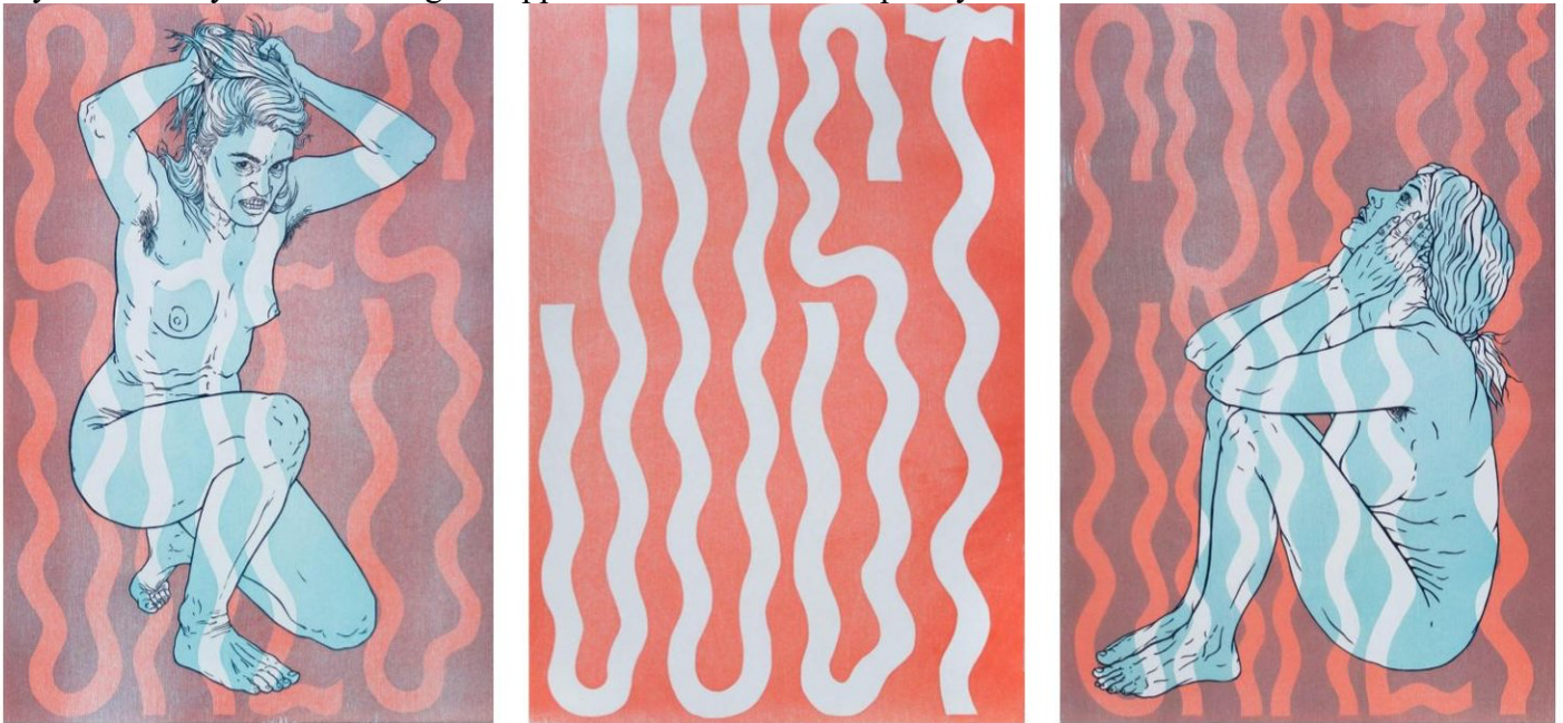
She's Just Crazy , 2022. Woodcut. 22 x 15 inches (each). Triptych each editioned at 15.